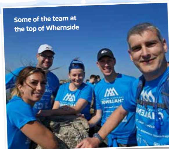
Some of the team at the top of Whenside

Everyone Active, our leisure contractor, kindly sponsored the entry fees for the team and staff paid for their own travel and accommodation.